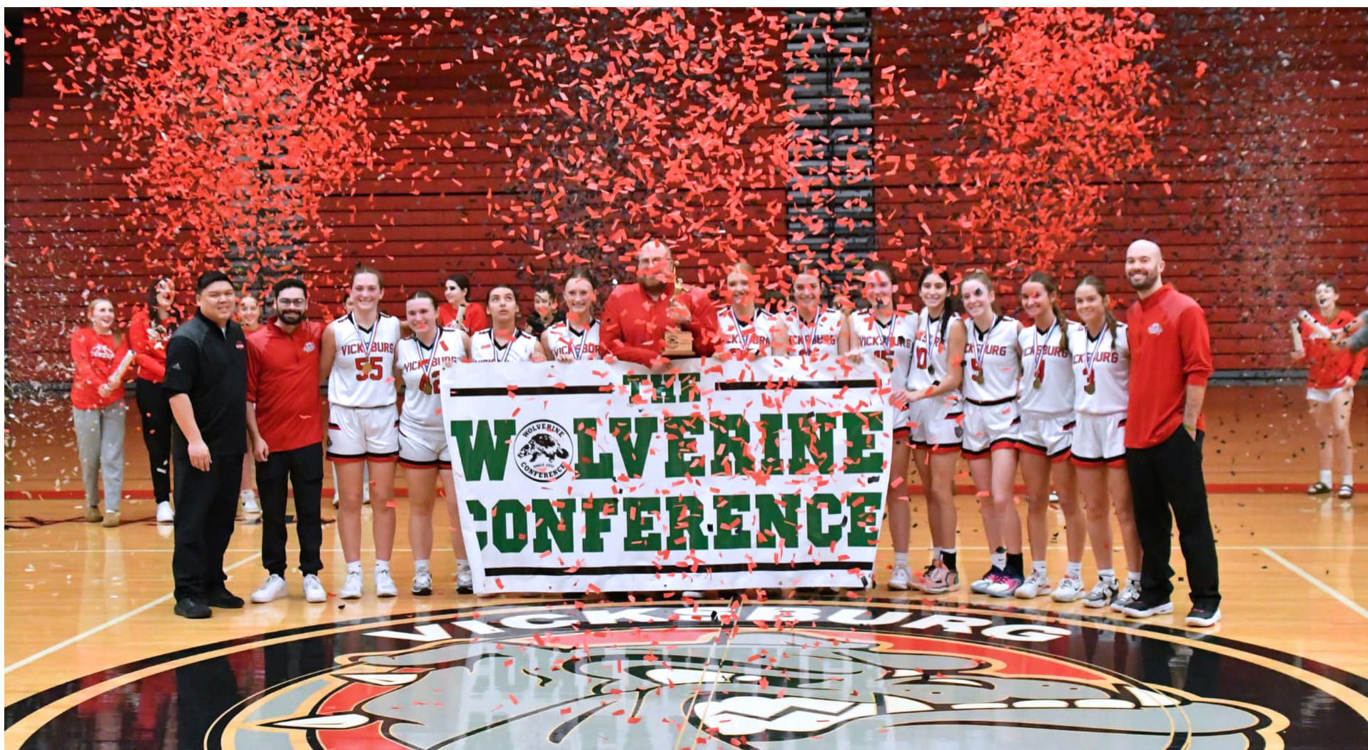
The Vicksburg High School Girls Varsity Basketball Team won the Wolverine Conference